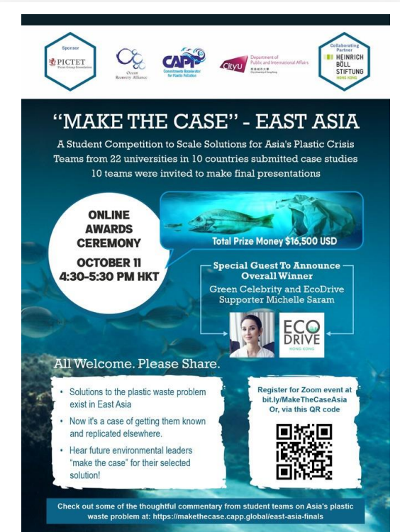
East Asia 2022